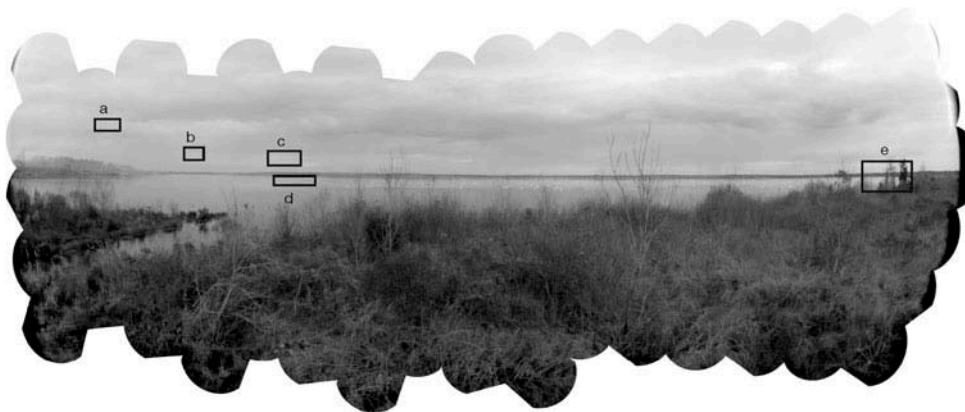
Fig. 1 Duke University/University of Arizona, Pungo Lake as captured using AWARE-2, 2011/2012. Copyright Nature Publishing Group.

Since the full resolution of the image can only be seen with magnification, the researchers highlighted four small areas of the full image capture on which to zoom in, marked a–e in rectangular boxes (Figure 2). Below the primary image, these secondary